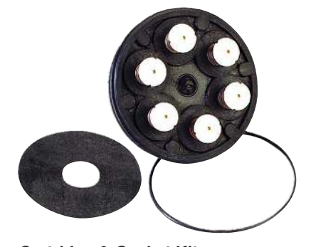
Cartridge & Gasket Kit