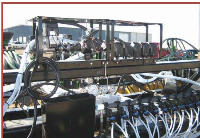
Auto Rate system with 5 sectional controls.

Variable Rate & Sectional Control Systems