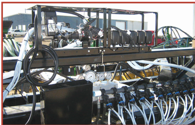
Auto Rate system with 5 sectional controls.