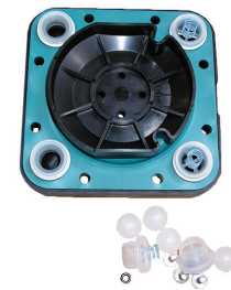
Rebuild kit 400B series