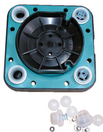
Rebuild kit 400B series